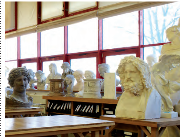
The casting studio