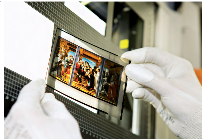
The photo agency's skills