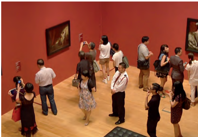
France's masterpieces in China exhibition, National museum of China