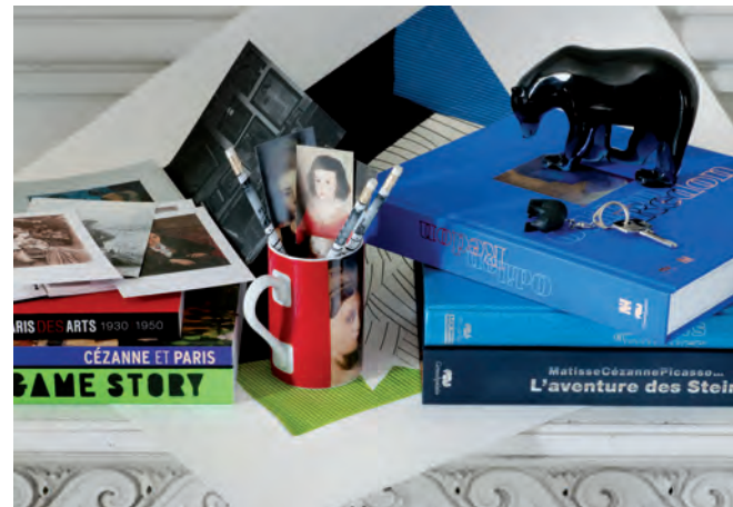
Rmn-GP's publications and products.