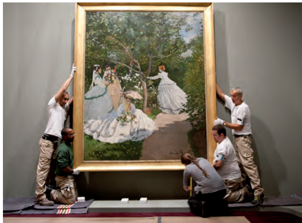
Monet exhibition in the Grand Palais, making-of.