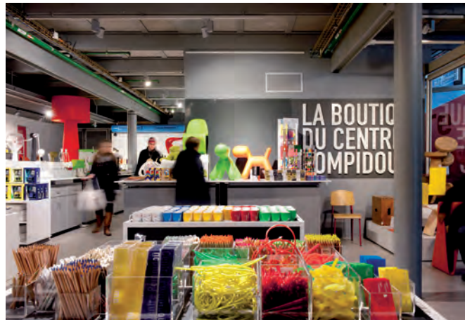
The Centre Pompidou shop